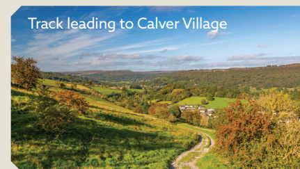
Track leading to Calver Village

Take the footpath on the left hand side of the village hall drive and cross a farm driveway at the top. Go through the pedestrian gate to the next gate. After going through this, the path goes to the far left hand corner of the field in the trees. Go through this gate and down a short track